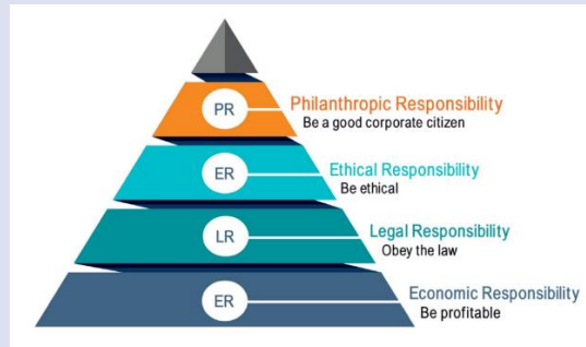
Figure 1. Carroll's Social Responsibility Pyramid

Advertising has a significant impact on perceptions. It is true that perception varies from person to person with experiences. By dint of perceptions, it is possible to examine the surroundings. The feelings that makes sense get the chance chosen. Since each person's perception is different, the observation of each person is different from each other. Knowledge is either about something or knowledge is directly related to a particular subject. The information obtained during perception is only a reflection of reality. There is a difference between reality and perception. Perception can be about a person, an object, or an event based on previous experience. If there is continuity in perception, after a while, it begins to be invisible and not attract attention. For example, violations of ethical rules are taken for granted after a while and are considered normal. The features that coincide with attitudes, values, and beliefs that attract one's interest cause the perception to increase or decrease. Perception is not possible without realization. It changes according to needs. For example, an advertisement product that has not attracted the attention of a person until that day can charm her/him due to requirements, or at a wedding ceremony, each person pays attention to different aspects such as the ambiance, the costumes, the food served, or the quality of the service. In other words, there is a particularity called selective exposure.